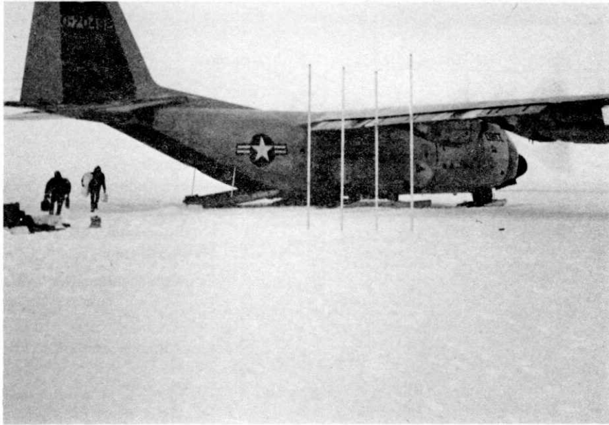
Figure 2. Aluminum poles marking Northsite. Station is at the southernmost (far right) pole.