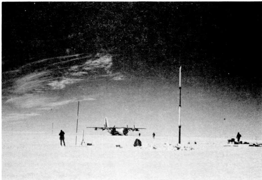
Figure 3. Geceiver positioning at Crete. EGIG pole T43 is between man at left and Geceiver antenna.