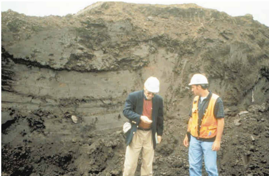
Figure A6. Stockpile of Portland cement processed material at Seaboard site