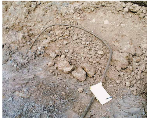
d. Steel cable