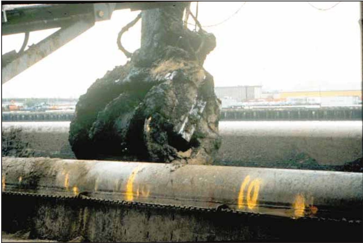
Figure 6. Backhoe-mounted rotary mixer

Port Newark, Seaboard Site. Dredged material from the Arthur Kill Federal Navigation Channel and from Port Newark was used as fill material at the Seaboard site after portland cement was mixed with the dredged material (Appendix I). Mechanically dredged sediment was placed in scows and transported to a dockside processing facility in Port Newark. The processing facility consisted of silos for storage of portland cement, a conveyor for transfer of portland cement to the scows, and a backhoe equipped with a rotary mixer (Figure 6).