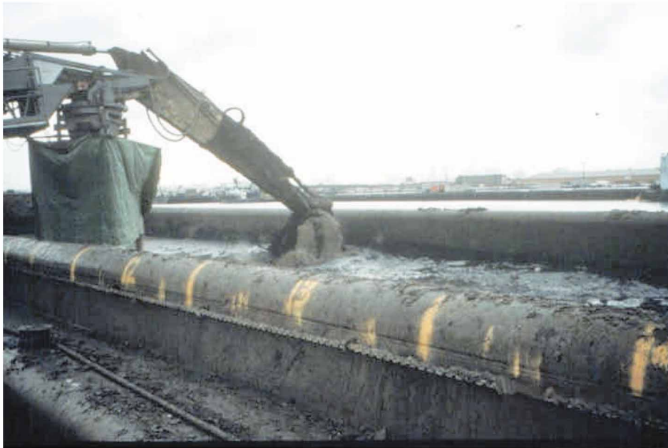
Figure A4. Rotary mixer in scow at Port Newark, Newark, NJ