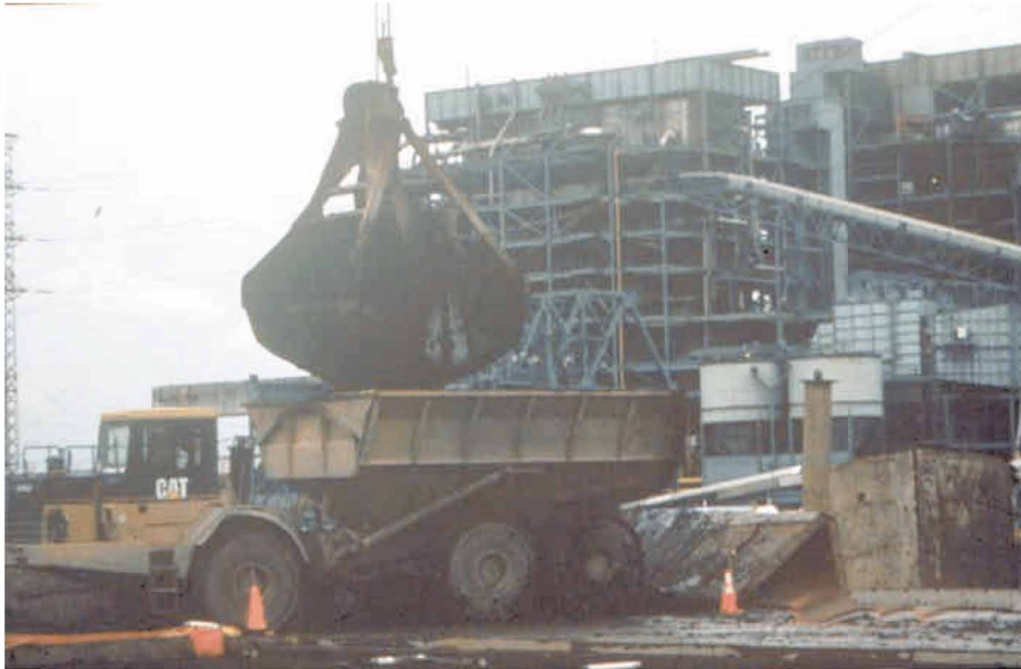
Figure A5. Transfer of processed material from scow to dump truck at Seaboard site