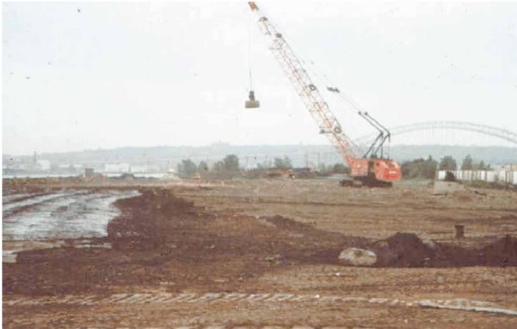
Figure A3. Dynamic compaction of Portland cement processed material at the Jersey Gardens Mall Site