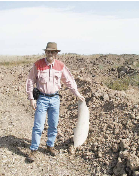
c. Plastic pipe