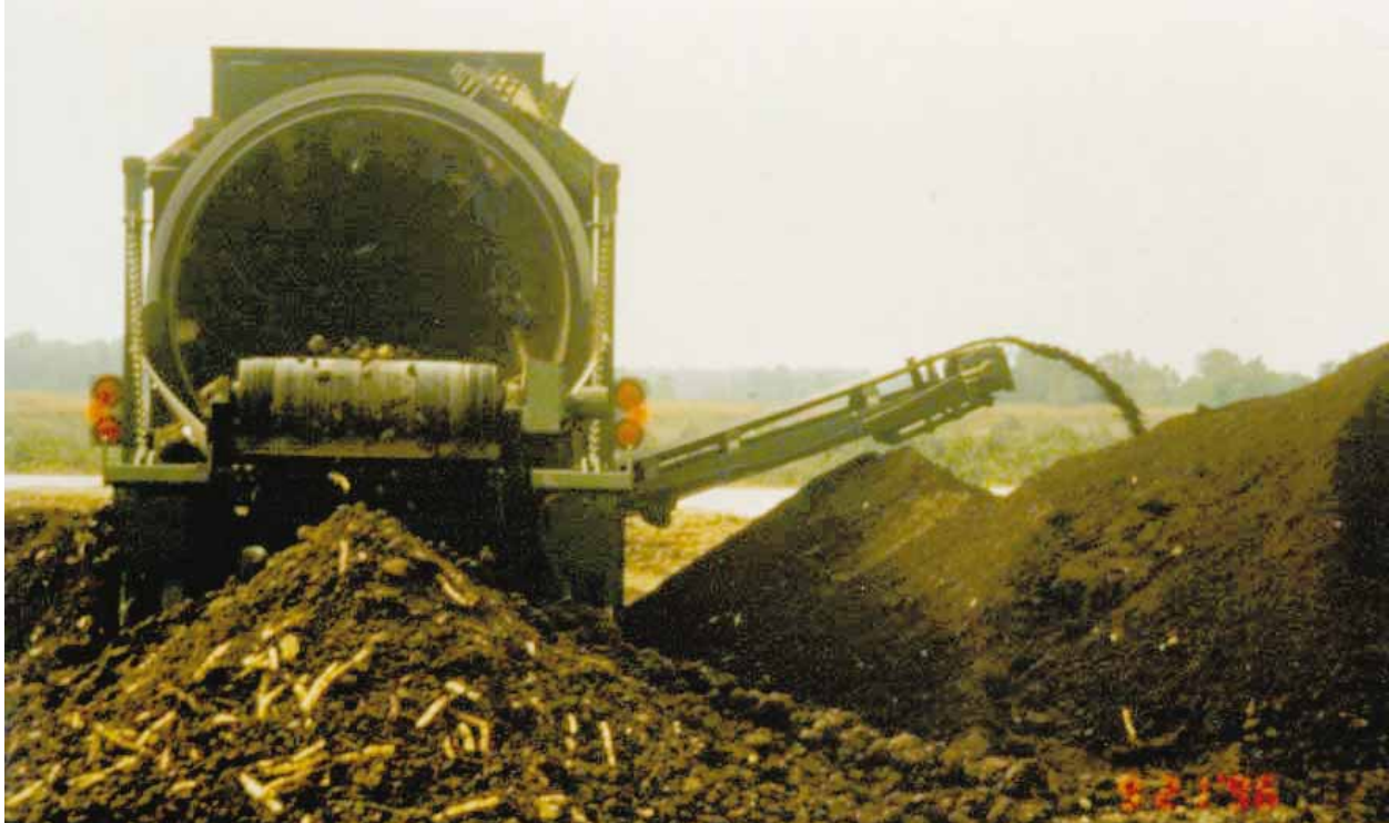
Figure 2. Portable truck-mounted trommel screen for removing extraneous plant rhizomes and clods (foreground) in manufactured topsoil (on right) from dredged material, yard waste, and biosolids at the Toledo, OH, CDF

brush, vegetation, and similar debris. Grubbing consists of the removal of below-ground matter that may interfere with subsequent operations, including stumps, roots, buried logs, and other objectionable material. Stripping consists of removal of low-growing vegetation and, in some cases, the organic topsoil layer (HQUSACE 1987). If trees are small, they may be cleared by wheeled tractors and bush hogs, if the dredged material is dry enough to provide traction. Otherwise crawler tractors and bulldozers may be required. Tree and brush disposal has to be considered. In some instances burning may be an option. Otherwise, trees and brush may be chipped to provide mulch or cellulose for manufacturing topsoil, hauled to other disposal sites, or left to decay.