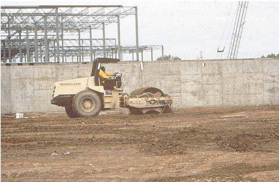
Figure A2. Drum roller compaction of Portland cement processed material at the Jersey Gardens Mall site