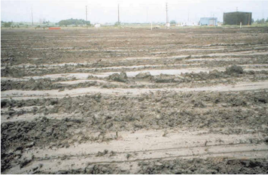
Figure A1. Freshly placed, Portland cement processed material at the Jersey Gardens Mall Site, Elizabeth, NJ