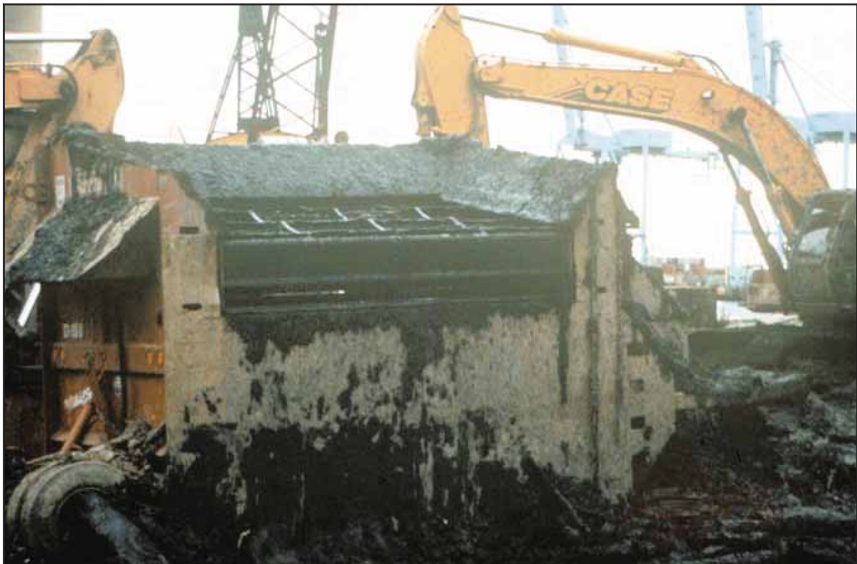
Figure 5. Grizzly at Construction and Marine Equipment Company site

Construction and Marine Equipment Company Site. Dredged material was processed prior to being sent by rail cars to Pennsylvania for use in strip-mine reclamation (Appendix I). Mechanically dredged sediment from the municipal marina in Perth Amboy, NJ, was offloaded with a bucket dredge at a dock, passed through a grizzly to remove debris (Figure 5), then mixed with coal fly ash in a pug mill. Pug mills are easily disabled by debris, and as Figure 5 shows, tires, timbers, and some other large pieces of debris were removed by the grizzly.