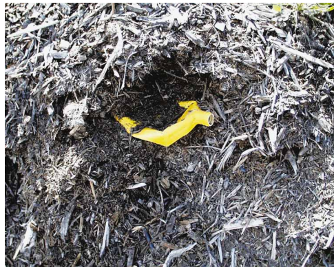
e. Plastic bottle