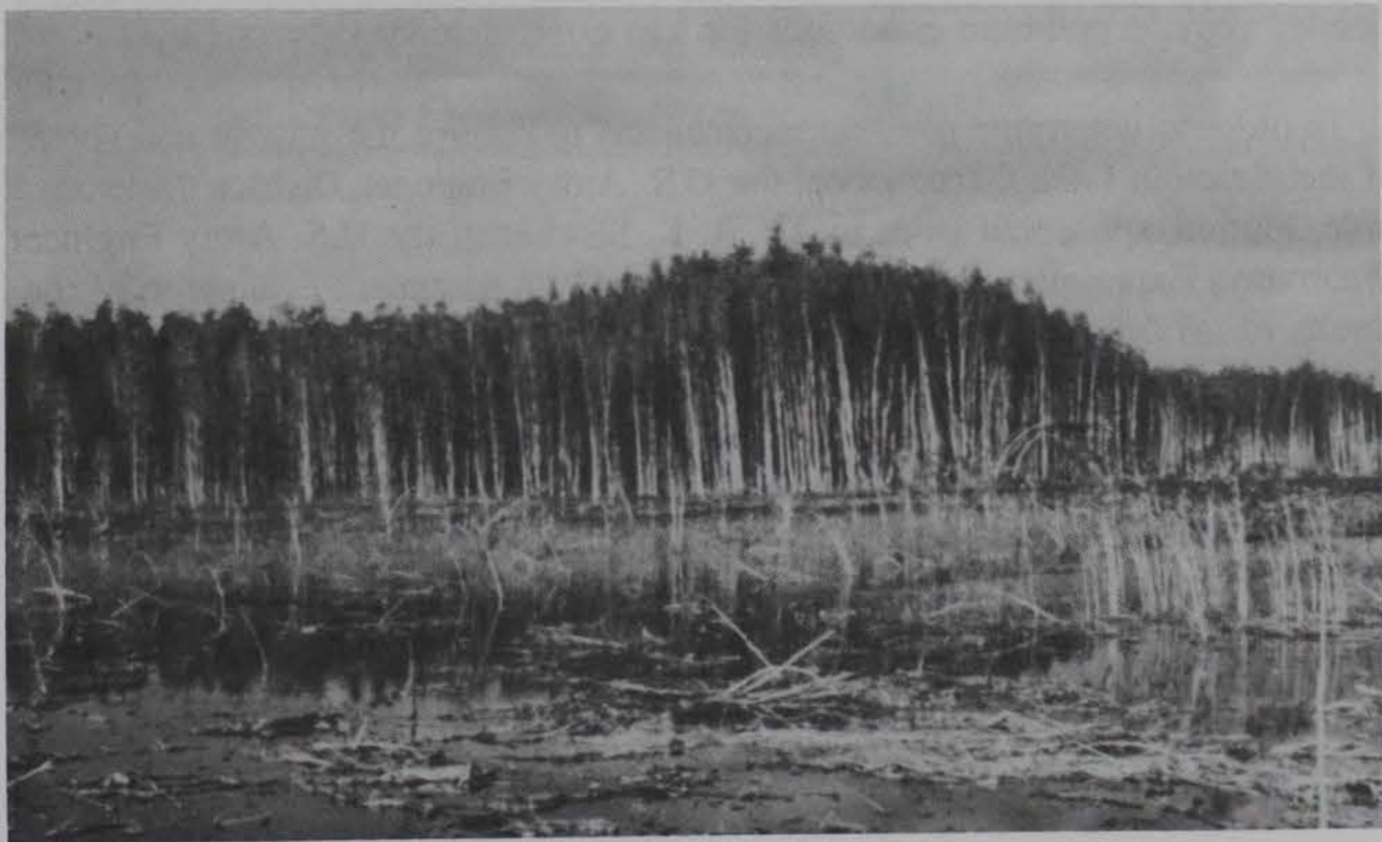
Figure 1. Mature stand of Melaleuca quinquenervia trees at Lake Okeechobee, Florida

Melaleuca quinquenervia (Cav.) Blake, common names melaleuca, cajeput, or punk tree, is native to the Australian region. Trees were first planted in Southern Florida early in the 20th century. Starting in the late 1940s, melaleuca was planted by U.S. Army Engineer personnel at Lake Okeechobee, Florida, to serve as wind barriers and to provide protection for the levees surrounding the lake. The trees have now spread to wetland habitats and were found by a 1979 survey to grow along 88.5 km (53.1 miles) of the 175 km (105 miles) of levee road and to cover approximately 96.8 ha (242 acres) in these perimeter stands (Stocker 1982a) (Figure 1). Additionally, Stocker found that "in the lake proper, melaleuca is found in approximately 420 ha