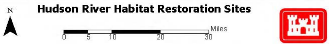
Figure 2 Final Array of Sites