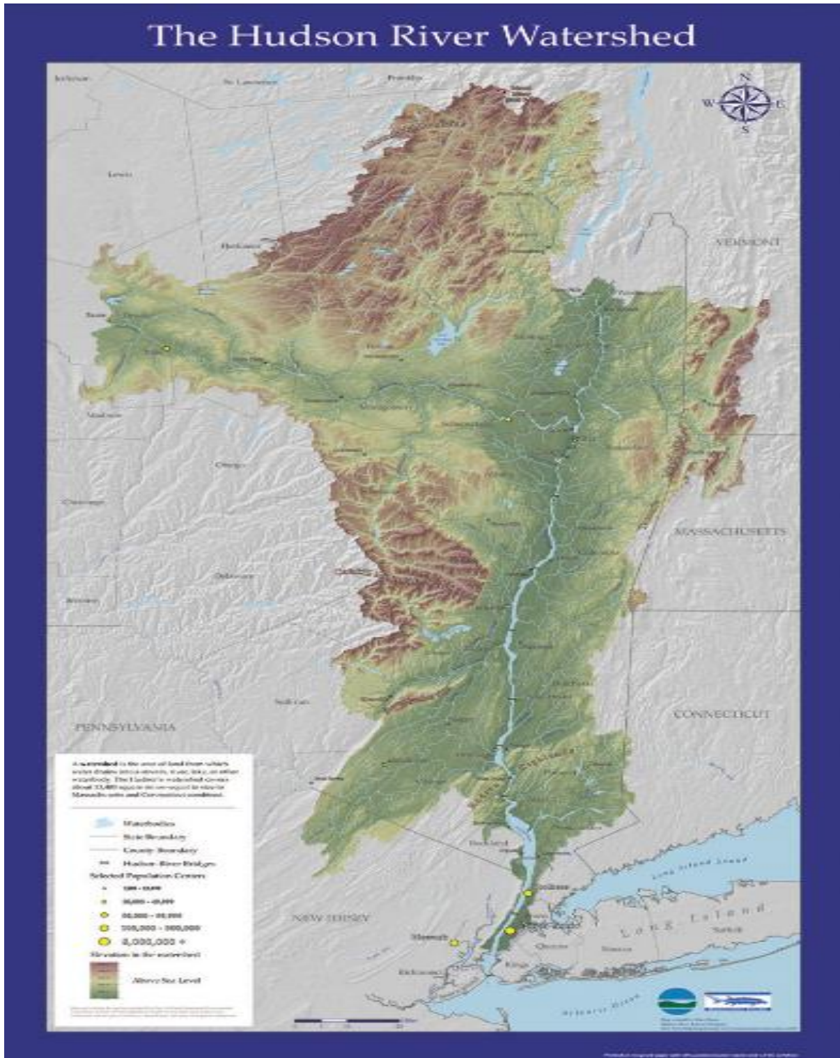
Figure 1 Hudson River Watershed