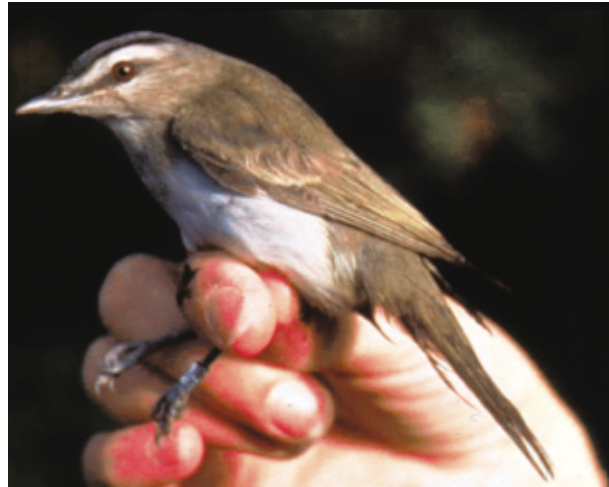
Some neotropical migrant songbirds, such as this red-eyed vireo, breed in buffer strips if enough interior forest habitat is available

The adverse impacts of these activities are often detrimental to riparian and aquatic habitats, especially where protective buffer strips are not retained or established and subsequently managed as part of the project plan.