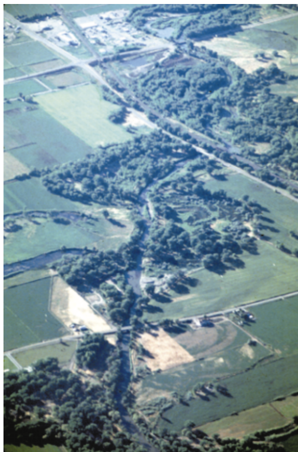
Riparian buffer zones remove nonpoint source pollution from adjacent land-use practices, such as agriculture, and also provide critical wildlife habitat

This article describes work to develop technical guidelines for restoring and managing riparian buffer zones and corridors. The potential benefits—with regard to water quality and many important ecological functions—are significant.