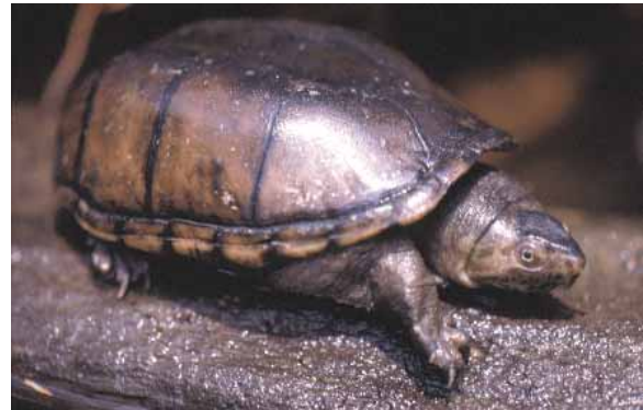
Mississippi Mud Turtle

BACKGROUND: Changing water levels or other operations at U.S. Army Corps of Engineers (USACE) reservoirs may impact critical habitat parameters for mud and musk turtle species. This technical note identifies mud and musk turtle species and habitats potentially impacted by USACE reservoir or other water-control projects as reported by resource managers (Table 1). Current state and/or Federal legal protection status is summarized (Figure 1, Table 2), as is the distribution of USACE Districts and reservoir projects potentially impacted by mud and musk turtle conservation issues. Life-history summaries and habitat requirement descriptions are given for each mud and musk turtle species identified as potentially impacted at reservoir operations. This group includes 10 species with