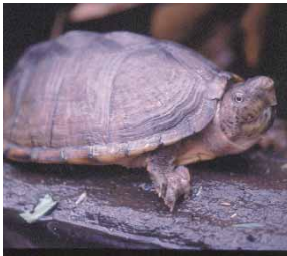
Razorback Musk Turtle

legal protection in at least one state and one Federally threatened species. Three of these species are associated with environmental issues at 23 USACE projects from 1 USACE District.