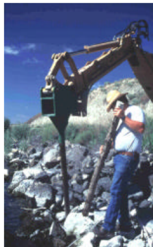
Figure 5. Stinger on backhoe making pilot hole in which to insert a dormant willow post

The CGR needs to be keyed into the bank or abutted to a hardpoint, preferably a rock refusal that has a rock root back into the bank to prevent flanking.