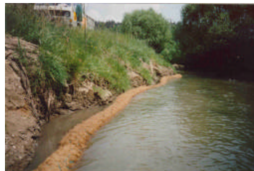
Figure 2. CGR on German stream 1 year after installation