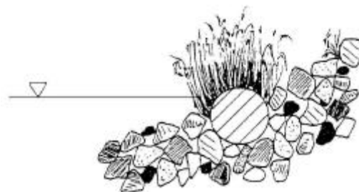
Figure 3. CGR shown at an appropriate elevation to sustain emergent plant growth (from Bestmann GmbH, Wedel, Germany)

Elevation of the CGR must be suited to the vegetation for which it provides substrate. In general, the CGR must be at an elevation that permits absorption of water to prevent desiccation of the planted vegetation. But it should not be placed so low as to inundate the vegetation for a period beyond its flood tolerance (Figure 3). If stacked rolls are used, they must be in a position to be wetted quite often or to absorb ground-water percolating from the bank. When willow whips or other woody plants are used between stacked CGRs as brush layers with their basal ends inserted well into a moist zone within the bank, there is no requirement for periodic wetting. In these cases, CGRs are intended primarily to provide temporary sediment and erosion control.