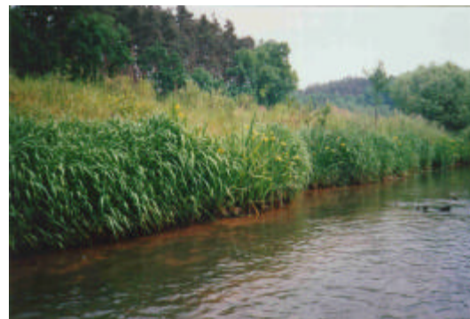
Figure 1. CGR after installation along a German stream

The CGR concomitantly benefits fisheries habitat by providing both food and cover due to its proximity to the edge of the stream. When rocks are used at the base of the CGR, the rocks and CGR act together to produce substrates suited for an array of aquatic organisms. Some of these organisms adapt to living on and within the rocks,