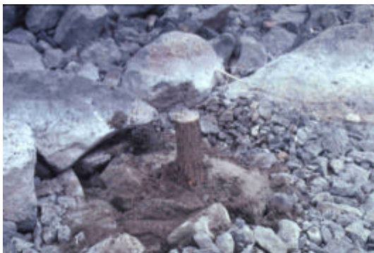
Figure 7. Willow post emerging from the ground

Planting a CGR can be accomplished by either pre-growing plants hydroponically in water troughs at the nursery or by planting them in place along the streambank. In either case, one must create a hole in the CGR in which to