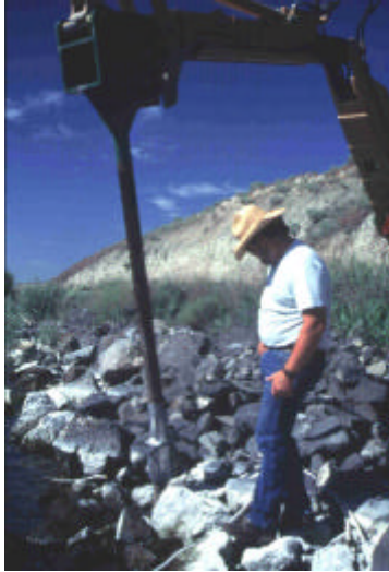
Figure 6. Stinger inserted into metal cap pushing willow post into rock

Planting a CGR can be accomplished by either pre-growing plants hydroponically in water troughs at the nursery or by planting them in place along the streambank. In either case, one must create a hole in the CGR in which to