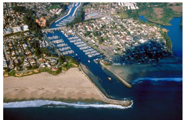
Figure 1. Healthy streams and riparian zones support important functions, even if their form has been altered from historic conditions.

This report presents the functional framework and discusses ways in which the framework can be applied to support the Corps’ Ecosystem Restoration and Urban Flood Damage Reduction Programs.