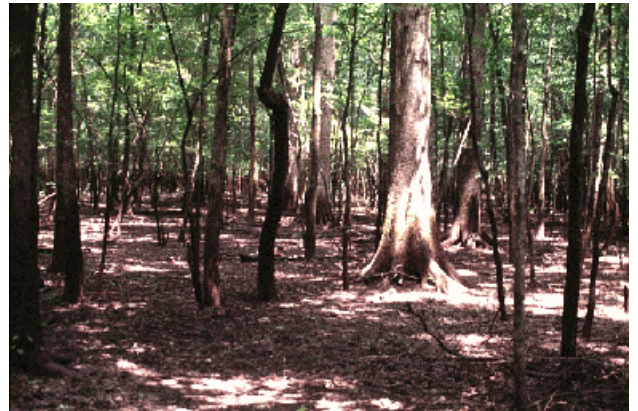
Figure 2. Bottomland hardwoods, typically labeled as a floodplain forest, are a type of riparian community.

adjacent uplands frequently are dominated by deciduous hardwoods, making the riparian zone a less-conspicuous component of the landscape (Johnson and Lowe 1985).