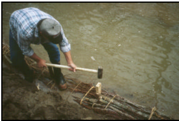
Figure 5. Installing an inert fascine structure