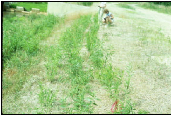
Figure 4. A live fascine during initial growth.