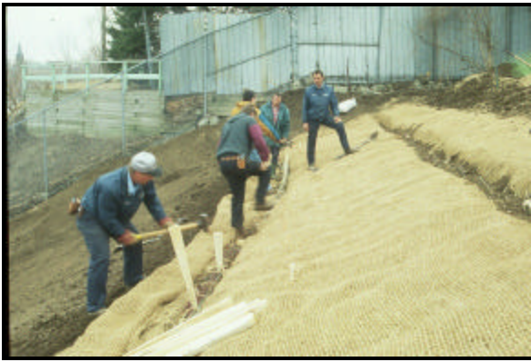
Figure 6. Dead stout stakes