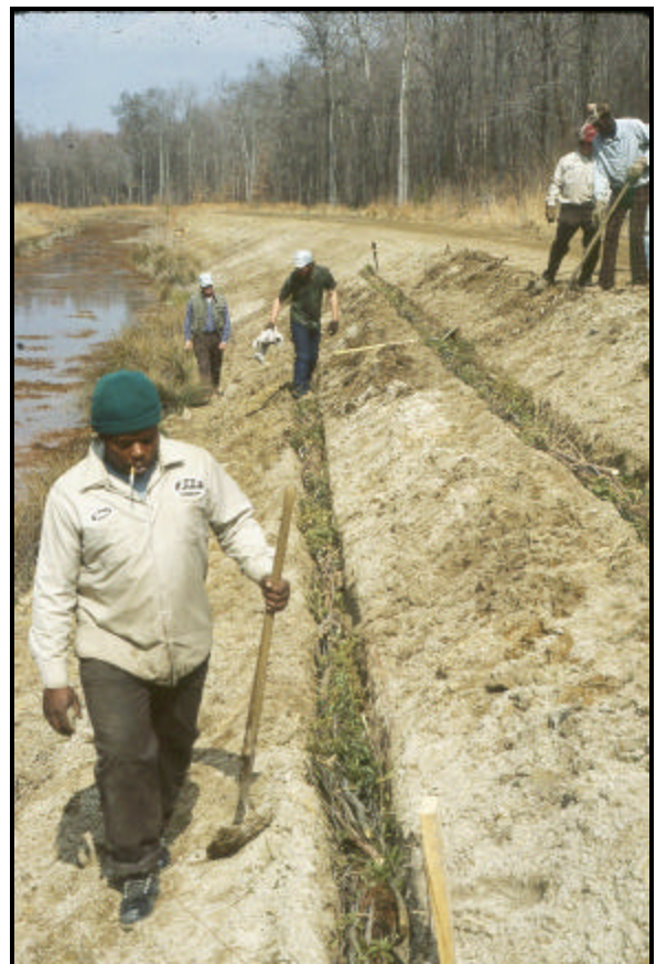
Figure 3. Installing a live fascine structure

LF costs range from $10 to $30/ft for 6- to 8-in. bundles. IF costs range from $10 to $26/ft for 12-in. bundles and $14 to $30/ft for 18-in. bundles. These prices include securing devices for installation, twine (for fabrication), harvesting, transportation, handling, fabrication, and storage of the live-cut branch materials, excavation, backfill, and compaction. Costs, however, vary with design, access, time of year, and labor rates. Bundles fabrication is relatively simple and is performed prior to installation. Both LF and IF structures may be fabricated in custom diameters for special needs. Installation is also relatively straightforward because large equipment is not required except to slope the bank.