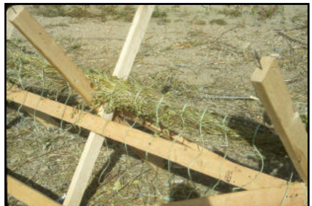
Figure 2. A fabricated live fascine structure

Plants behind or within the IF bundle, especially emergent aquatic plants that invade and establish over time, such as bulrush ( Scirpus spp. ) and sedges ( Carex spp. ), will