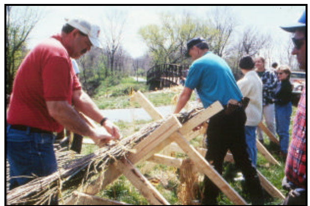
Figure 1. Building a live fascine structure

LF and IF benefit fisheries habitat by providing food and cover when they are used in close proximity to the edge of the stream. Stone used at the base of the LF or IF provides substrate for an array of aquatic organisms. Some of these organisms adapt to living on and within the rocks while others utilize the leaves and stems for habitat or as food. LF or IF can improve water quality and aesthetics. Plants within the LF or IF can be selected to provide color, texture, and other attributes that add a pleasant, natural landscape appearance.