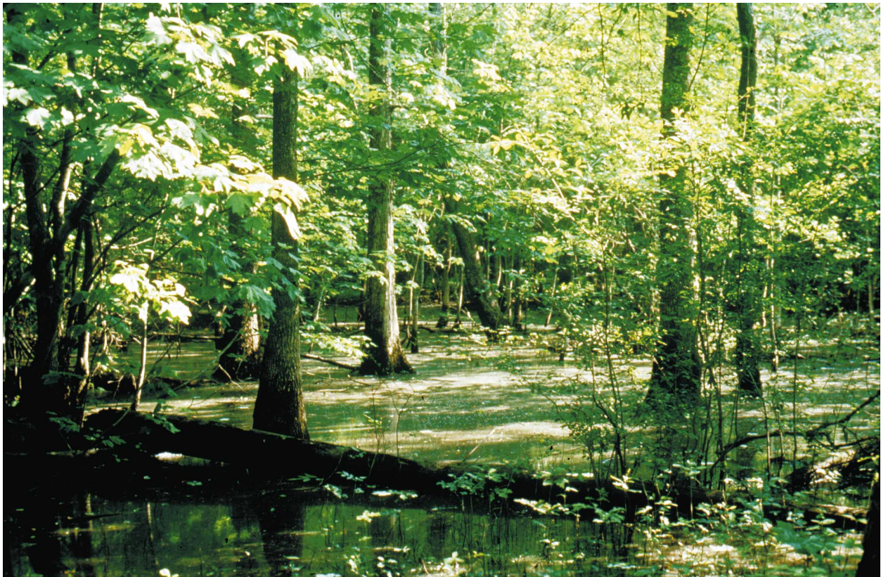
Figure 1. Below-ground processes are poorly understood in BLH wetland forests of the southeastern United States

BACKGROUND: Conversion of BLH wetland forests to agriculture is a primary cause of wetland loss in the southeastern United States (Figure 1). Restoration of BLH in abandoned agricultural fields, however, has had limited success. Low survival rates of planted trees are a consequence of several environmental factors such as water stress and herbivory. However, pilot studies of growth of seedlings inoculated with mycorrhizae native to BLH wetland forests suggest that disturbance of the soil microflora, including mycorrhizae, by agricultural practices may contribute to poor seedling survival rates.