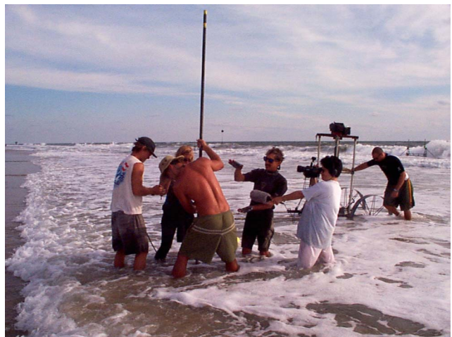
Figure 1. Instruments being deployed during SandyDuck

SandyDuck '97 experiment included 30 investigations of varying complexity, using a variety of instruments (Table 1, Figure 2). While the collected data were initially of interest to the participating investigators, they are also useful to a wide range of government, academic, and private researchers. By agreement it was resolved that experimenters' data would become publicly available three years after the experiment. The goal of this work was to compile the most important SandyDuck '97 geophysical nearshore process data into a single coherent data set, and to make the data publicly available via the web for broad usage by those interested in physical processes in the littoral zone. The SandyDuck '97 data set will be added to the DUCK94 data ( http://dksrv.usace.army.mil/jg/dk94dir ), and the 1990 DELILAH experiment data ( http://dksrv.usace.army.mil/jg/del90dir ).