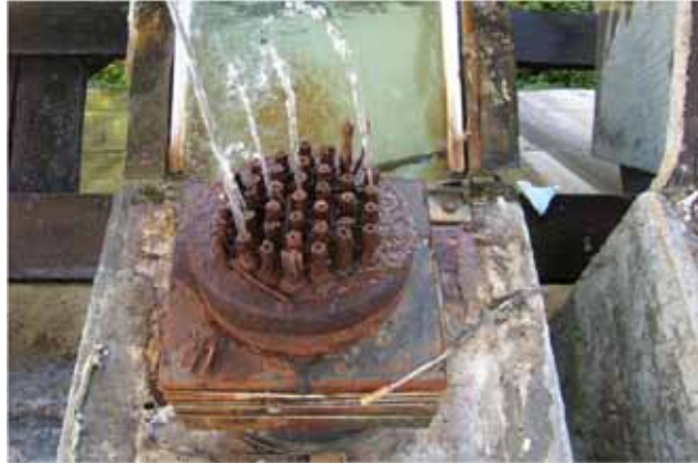
Figure 5. 2008 inspection (and lift-off testing) of multi-strand tendons showing loss of center wire and flow of water through several of the 7-stand wires.

Other factors that may be contributing to failed strands and other observations are: