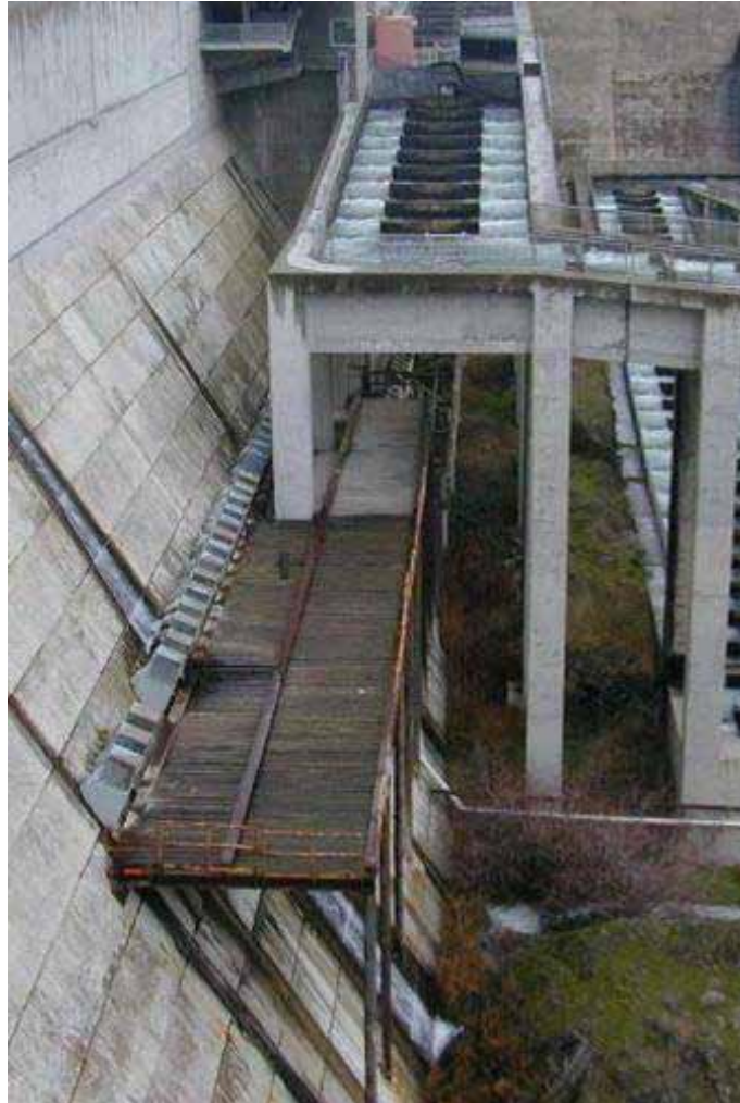
Figure 3. Anchor head pedestals and protective covers along the south lock wall access deck.