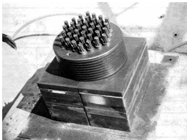
Figure 4. Original 1981 threaded anchor head with spacers and wedges resting on the anchor pedestal.