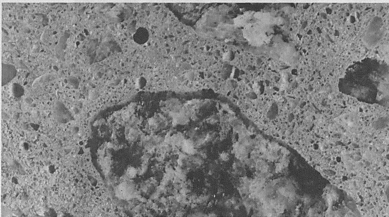
Photograph 2. Enlargement of granite gneiss particle on left side of core in Photograph 1, about 3.5X. The reaction rim is apparent.